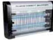
49 99 Flying Insect Zapper 660-2000 Reg. $59.99