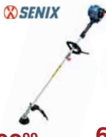
109 99 31cc 4 Cycle Straight Trimmer 4433-0001 Reg. $129.99