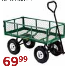
69 99 400 Lb. Steel Cart 3654-0008 Reg. $79.99 1200 Lb. Steel Cart...$119.99 3654-0013 Reg. $139.99