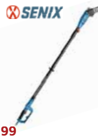
69 99 6.5 Amp 15" Electric Pole Saw With up to 8.8 Ft. telescoping pole. 4433-0003 Reg. $79.99