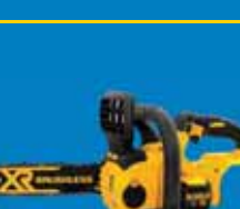
149 99 DeWALT 20V Bare* 12" Chainsaw *Battery not included. 96-4649