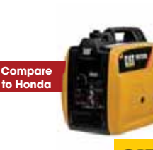
699 99 CAT 2000W Inverter 4257-0001 Reg. $849.99