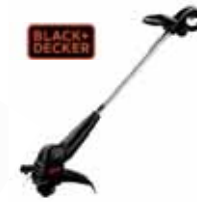
29 99 12" Electric String Trimmer/Edger 96-4642