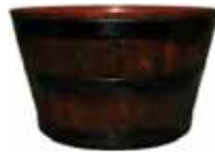
9 99 20.5" Plastic Whiskey Barrel Planter 1679-0000 Reg. $12.99