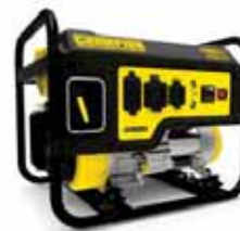
349 99 3500W Generator 101-5006