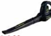
29 99 160 MHP Corded Blower 4262-0001