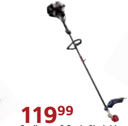
119 99 Craftsman 2 Cycle Straight Shaft Trimmer 3215-4101 Reg. $129.99