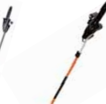
79 99 Remington Electric Pole Saw 29-1204 Reg. $99.99