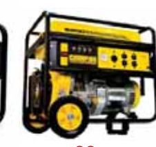
549 99 5000/6250W Generator with Wheel Kit 101-4007