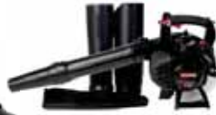
129 99 27cc 2 Cycle 205MPH Variable Speed Blower/Vac 3215-4114 Reg. $149.99