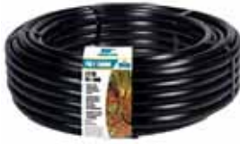
10 99 1/2" X 100 Ft. Drip Tubing 5074-0129 Reg. $11.99