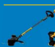
129 99 DeWALT 20V Bare* String Trimmer *Battery not included. 96-4640