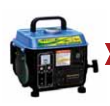
119 99 1250W 2 Stroke Generator 4321-0001 Reg. $139.99