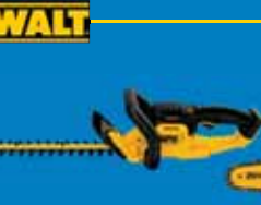
139 99 DeWALT 20V Bare* Hedge Trimmer *Battery not included. 96-4022