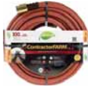
36 99 100 Ft. Contractor Farm Hose 1-1484 Reg. $39.99