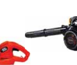
79 99 Poulan Pro 2 Cycle 25cc Blower 1565-1319 Reg. $89.99