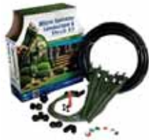
44 99 1000 Sq. Ft. Deluxe Drip Watering Kit 5074-0446 Reg. $49.99