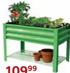
109 99 Stand Up Raised Garden Planter Green or Brown. 6748-0511, 0512 Reg. $129.99