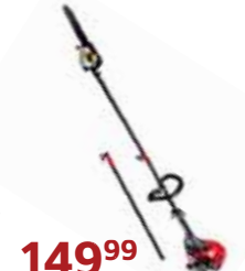
149 99 Craftsman 25cc Gas Pole Saw 3215-4134 Reg. $179.99