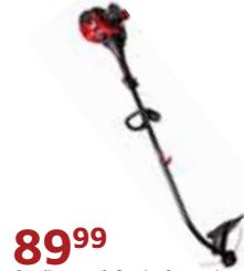
89 99 Craftsman 2 Cycle Curved Shaft Trimmer 3215-4100 Reg. $99.99