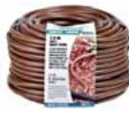
5 99 1/4" X 100 Ft. Brown Micro Tubing 5074-0381 Reg. $6.99