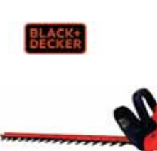
34 99 18" Electric Hedge Trimmer 96-1424 Reg. $39.99