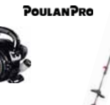
139 99 Poulan Pro 25cc Gas Pole Pruner 1565-0440 Reg. $169.99