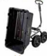
109 99 1200 Lb. Poly Dump Cart 3654-0009 Reg. $139.99 600 Lb. Poly Dump Cart...$69.99 3654-0014 Reg. $79.99