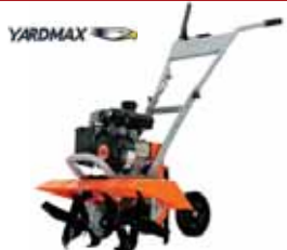
299 99 EVERYDAY LOW PRICE LCT 98cc Front Tine Tiller Provides a tilling width of 11", 16", or 21" & tilling depths from 7" to 11". Removable outer tines allow tilling in tight spaces. 4265-0001