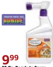
9 99 32 Oz. Ready to Spray Mosquito Beater 4052-0022 Reg. $12.99