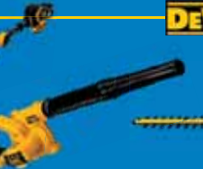
139 99 DeWALT 20V Bare* Blower *Battery not included. 96-4638